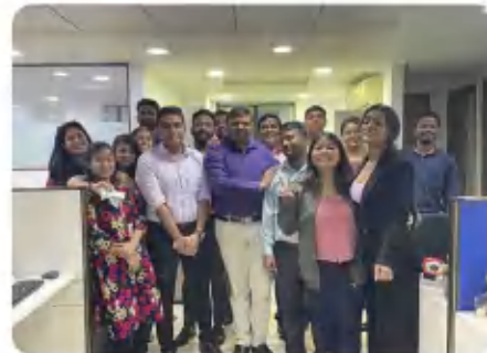
Day 8 Colour of your choice